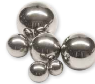
Stainless steel balls