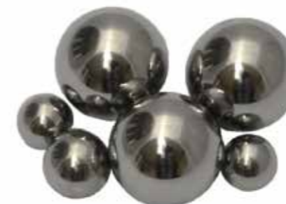
Tungsten carbide balls