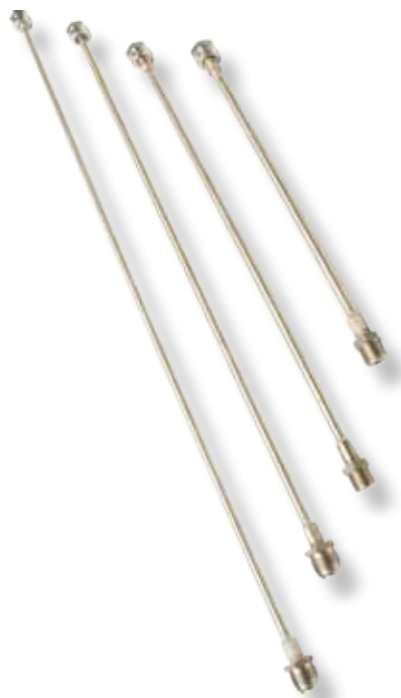
in STAINLESS STEEL