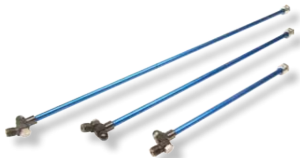
in ANODIZED ALUMINUM